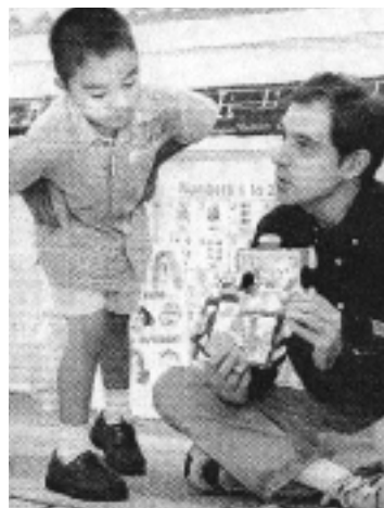
The New Mexican. Sunday September 10, 2000