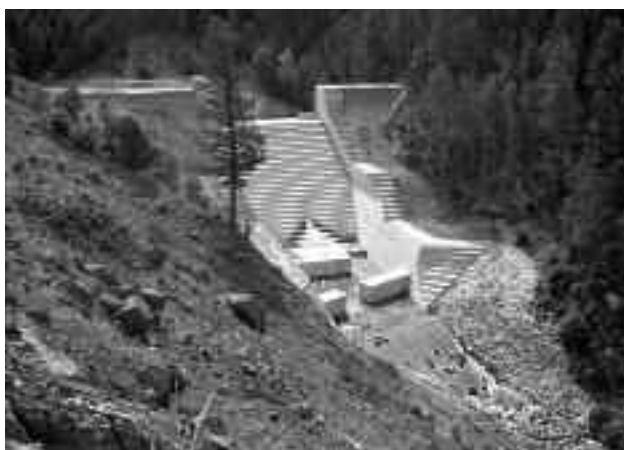
Cabresto Lake Dam.

To begin with, there is Cabresto Lake Dam near Questa, which underwent major repairs that were finished in 2014. The repairs took nearly a decade to complete and cost taxpayers more than $6.7 million, yet the Cabresto Lake Dam still leaks. This, of course, is extremely disappointing to downstream residents and farmers who depend on the dam to store irrigation water. As state