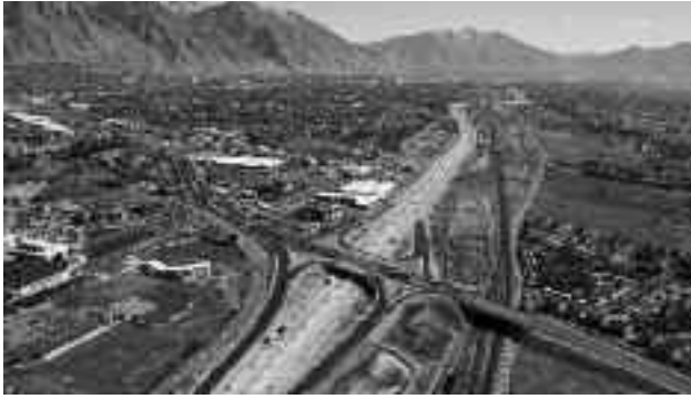
Major road reconstruction project completed in Orem, Utah.

project addresses life or safety issues, accommodates expected growth, enhances program effectiveness, supports critical programs, and is cost-effective, among other things.