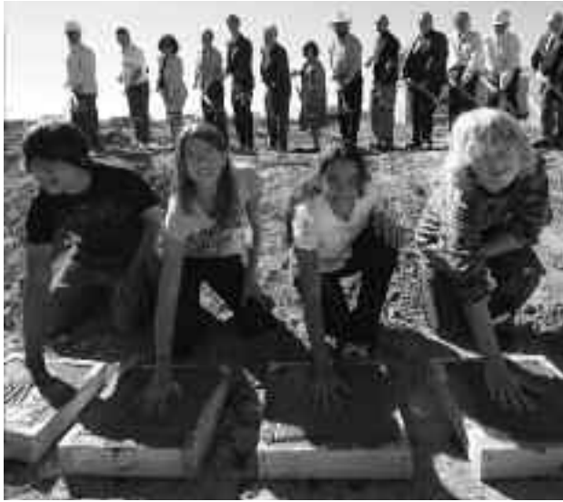
Groundbreaking for Moriarty Middle School in 2010, financed through the Public School Facilities Authority.

mously passed the Water Project Finance Act, which was tasked with prioritizing and funding the state's estimated $2.3 billion in critical water infrastructure needs.