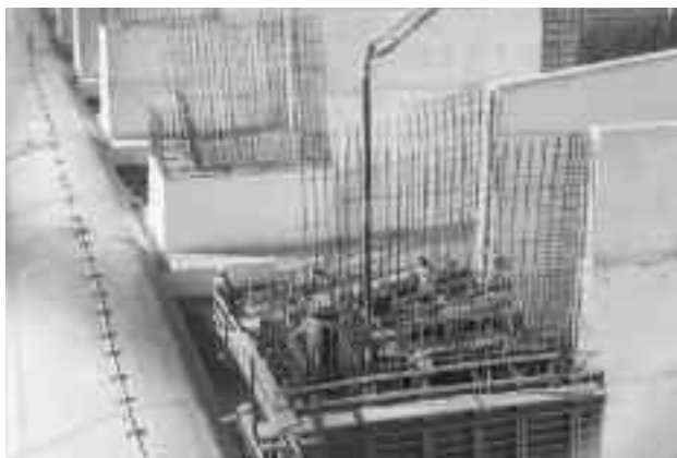
Workers upgrade Ute Dam on the Canadian River in 1983.

The project that became Ute Dam followed in the tradition of New Mexico's earliest public spending projects. In 1884, nearly three decades before statehood, New Mexico's Territorial Legislature authorized the issuance of general obligation bonds in the amounts of $200,000 and $150,000 to construct a territorial capitol and a territorial penitentiary in Santa Fe. The bondholders were paid back over a quarter of a century using funds raised from a tax on all property owners in the New Mexico Territory.