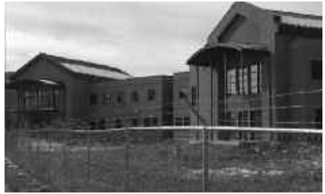
The shell of the half-finished Mora County Courthouse. Photo by Sandra Fish, New Mexico in Depth , 2015.

Senator Carlos Cisneros told the Taos News , “We have a dam and it’s not a bad looking dam except that it doesn’t hold water.”