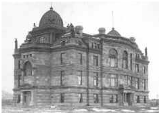
New Mexico's Territorial Capitol Building, built in 1886 with general obligation bond revenues.

An editorial in the February 3, 1961 Santa Fe New Mexican , entitled "Let's Save That Canadian Water," noted the symmetry of using a tax on one natural resource (oil, gas, and minerals) to pay for the development of another natural resource (water): "The most fitting use for this tax money is the preservation of other precious resources."